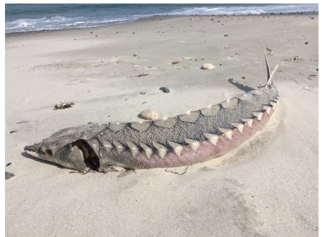
This sturgeon is not from Connecticut but from a Rhode Island beach this past week. The suggestion was made to inspect it for tags.