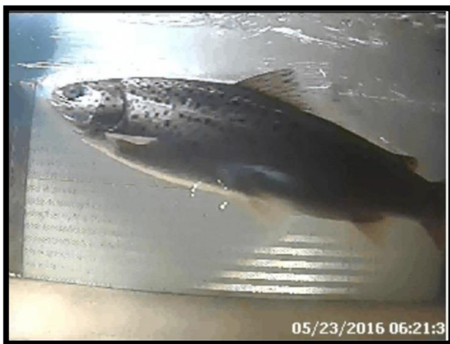
A beautiful sea-run brown trout passing the window at the Bunnells Pond Fishway. Note the chrome silver coloration—fresh from saltwater.

My weekly Diadromous Fish Radio show is live on iCRV ( www.iCRVradio.com ) at 8:00 am on Wednesday and re-played at 3:00 and 7:00 pm that day and 8 am on Saturday. In addition to updates on fish runs, this week we'll be talking about sea lamprey and its restoration to Connecticut streams.