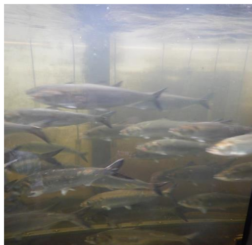
American shad celebrating World Fish Migration Day at the Holyoke Dam Fishlift. (Photo courtesy of Ken Sprankle, USFWS).